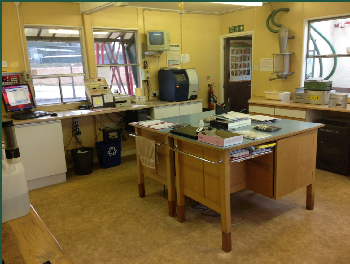
The old Laboratory